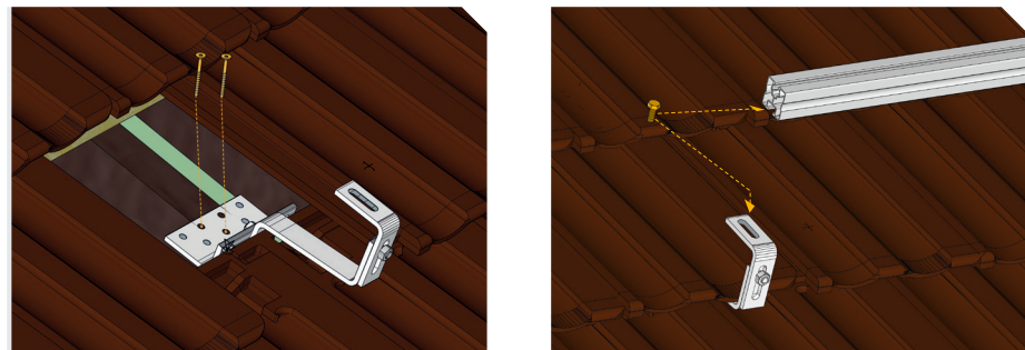
Diagram with rail